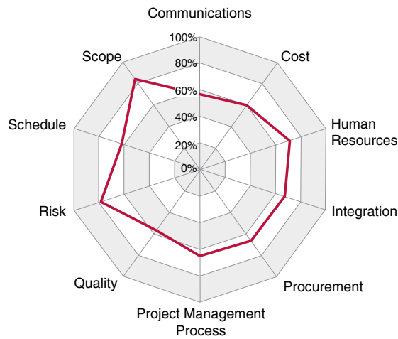
Example: Project assurance scores across 10 knowledge areas

For a small fee added to the daily rate of your contractors you can access our project health check and assurance services. Your PM-Partners group sales consultant can advise on the most effective configuration for your project portfolio.